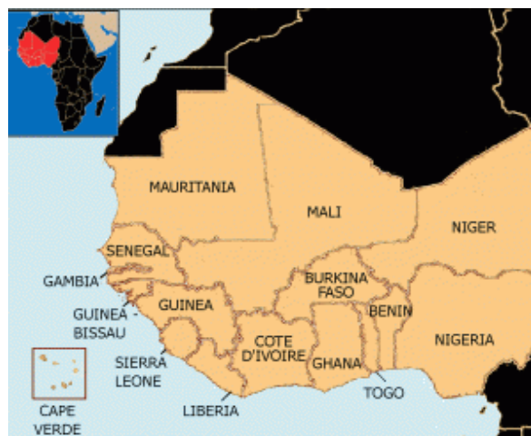
Map of West Africa